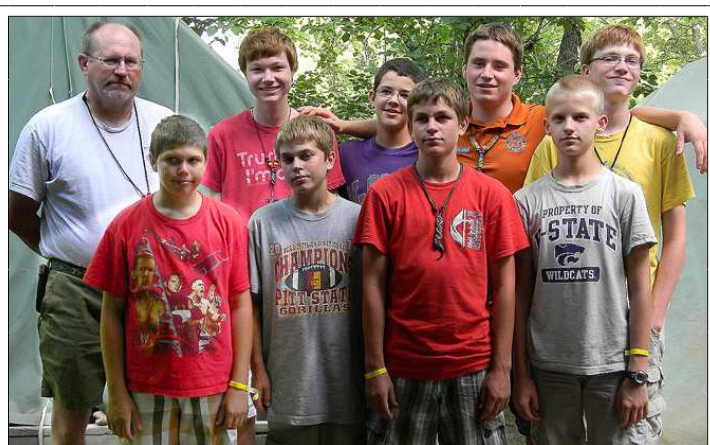
The Robinson Boy Scouts were at Camp Geiger July 14-20. Six scouts attended.